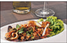
■ Auma serves European, Italian and Thai cuisine.

Here, one can get the food customised to suit one's palette. Thus eating at Auma is a personal experience. Soups and salads are the mainstay here and should not be missed. Soups like Kaeng Cherd Tauhu Lod, a clear vegetable and silky bean soup garnished with sautéed garlic, and the wild mushroom soup with the essence of truffle are surely a treat. The fine quality of the leafy vegetables