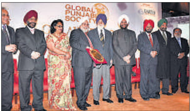
■ Punjabi achievers were felicitated at a function in Hotel Le Meridian.

The Skoda Prize for Indian Contemporary Art celebrated the opening of its annual art exhibition showcasing artworks of 20 artists at the Lalit Kala Akademi. The works comprise the best solo exhibitions held in the country in the last one-year. Of the 128 entries received from all over the country, the jury declared the 20 finalists after much deliberation. The evening also saw the unveiling of the Skoda Prize Top Twenty 2011-2012 book by